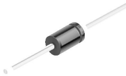
DO-41 Glass case COLOR BAND DENOTES CATHODE